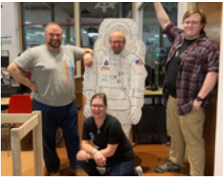
Some of TVCOG's Board members and Zone Coordinators celebrate Yuri's Night, one of our themed social nights for members.