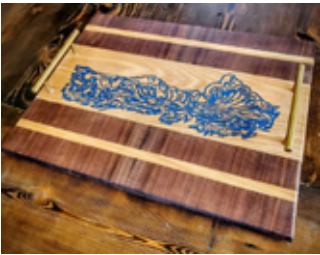
Woodshop Zone Coordinator Kris made this California inspired wooden tray serving using walnut and red oak with CNC inlay.